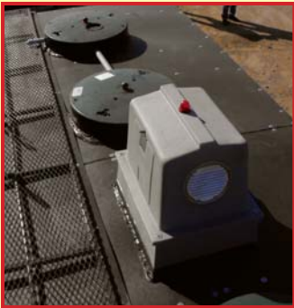
Designed for Ease of Maintenance