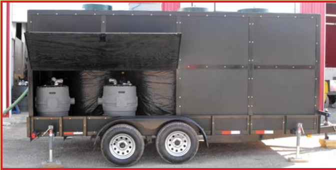
Up to 4 lift stations per unit handling 500 to 1000 gallons per day.